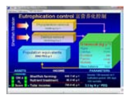
Mass balance for nutrient removal and overall water quality effects.